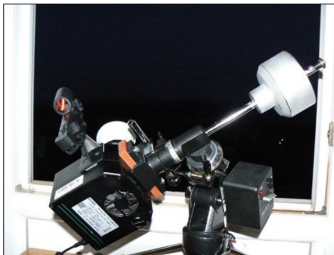
Figure 1. A mini telescope working from the window at a corridor.

small. Fig. 1 shows an example of a mini telescope set-up. Such a set-up has the following advantages: