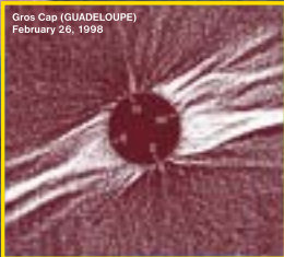
Gros Cap (GUADELOUPE) February 26, 1998