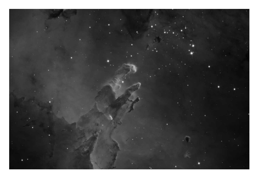
Figure 3. M16 – Pillars of Creation in Ha filter. Stack of 15 images with 5 min exposure.